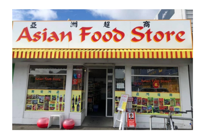
CJ Asian Supermarket Nelson

2/64 Montgomery Square, Nelson Phone 03 539 1412